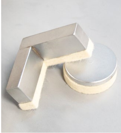
Magnetic L-shaped and round pads with felt

Mainline Mouldings Ltd. 83 Langar Industrial Estate, Harby Road, Langar, Nottingham, NG13 9HY t: 01949 861000 w: mainlinemouldings.com e: sales@mainlinemouldings.com