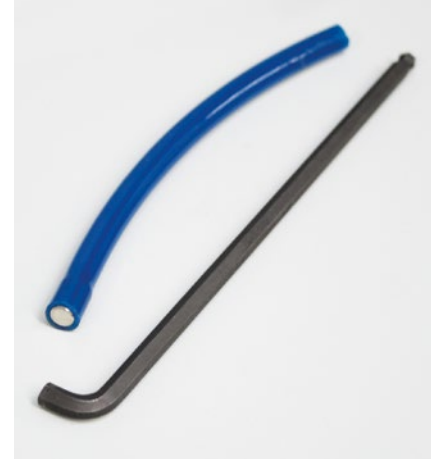
5mm Allen wrench and magnetic pen