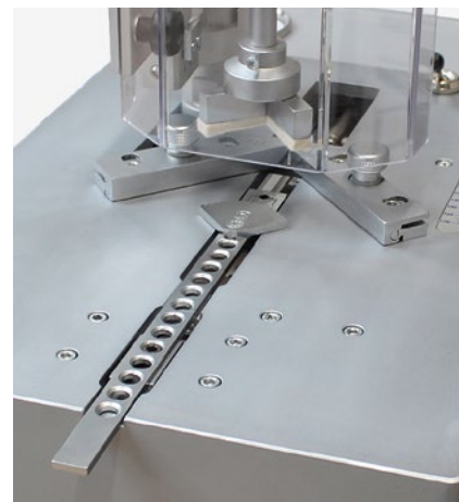
Horizontal clamp activated by the foot pedal