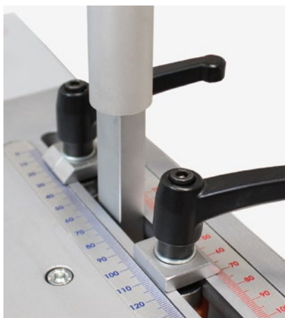
Two manually set position stops