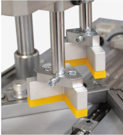
Double hydraulic clamp

Mainline Mouldings Ltd. 83 Langar Industrial Estate, Harby Road, Langar, Nottingham, NG13 9HY t: 01949 861000 w: mainlinemouldings.com e: sales@mainlinemouldings.com