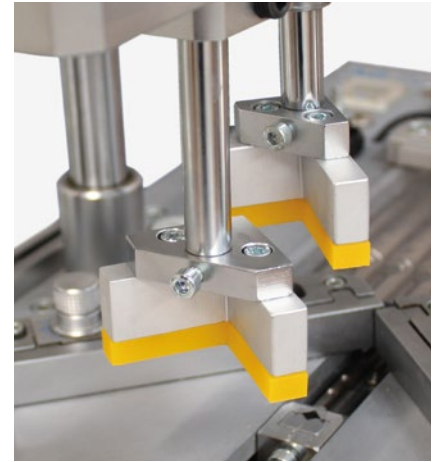
Double hydraulic clamp