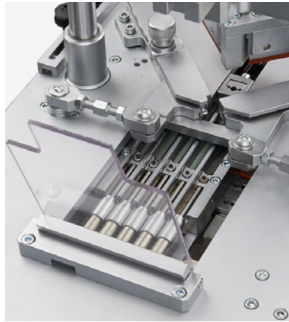
Multichannel magazine that can hold five different wedge sizes