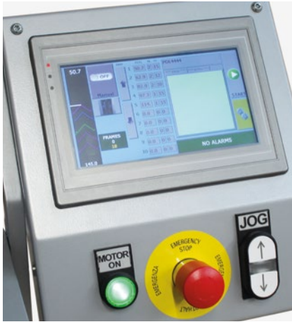
Smart Windows technology to store profile details

Mainline Mouldings Ltd. 83 Langar Industrial Estate, Harby Road, Langar, Nottingham, NG13 9HY t: 01949 861000 w: mainlinemouldings.com e: sales@mainlinemouldings.com