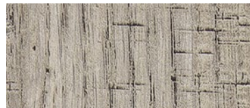
300-3146 | Grey