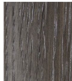
300-2147 | Black