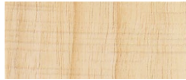
300-3144 | Natural