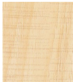
300-2144 | Natural