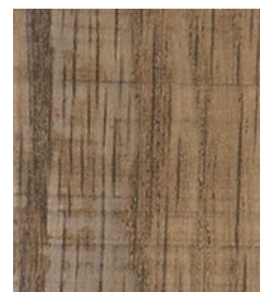
300-2145 | Walnut