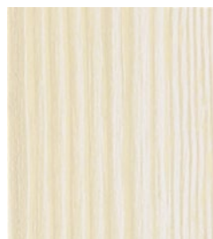
300-2143 | Cream