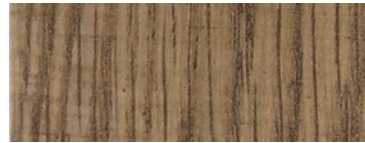
300-3145 | Walnut