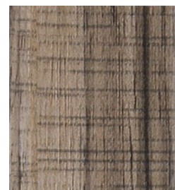
300-2148 | Walnut