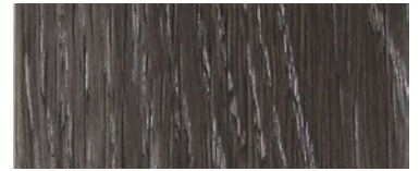
300-3147 | Black