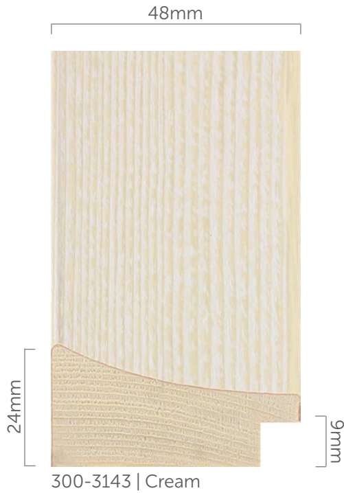
300-3143 | Cream