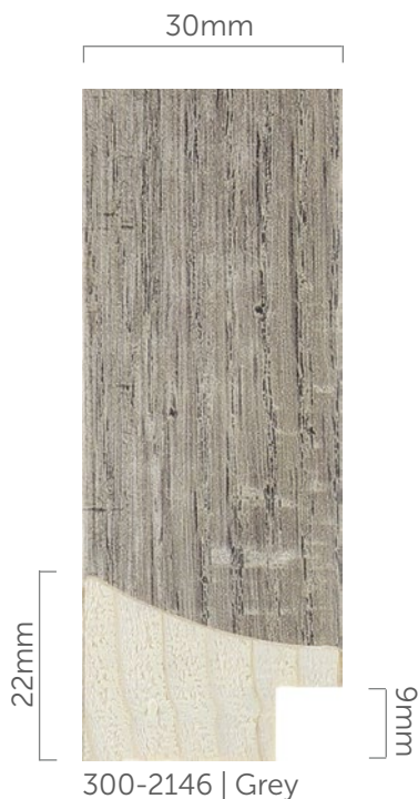
300-2146 | Grey