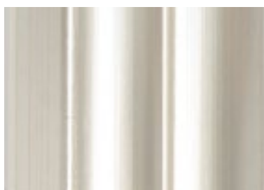
POL-2023 | Silver