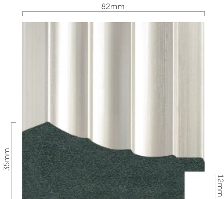
POL-2019 | Silver