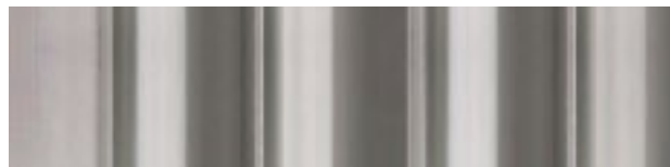
POL-2137 | Gunmetal