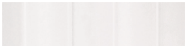
POL-2046 | White (Gloss)