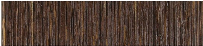
POL-2133 | Bronze