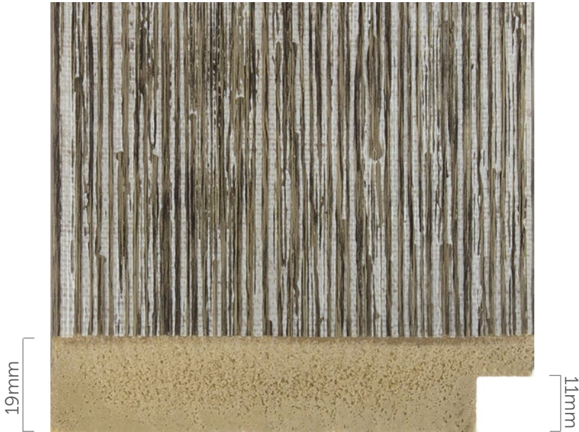
POL-2135 | Green