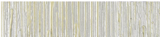
POL-2134 | Silver