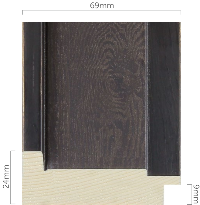
014-1322 | Walnut/Ebony