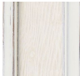
014-1224 | White