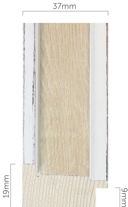
014-1223 | Natural