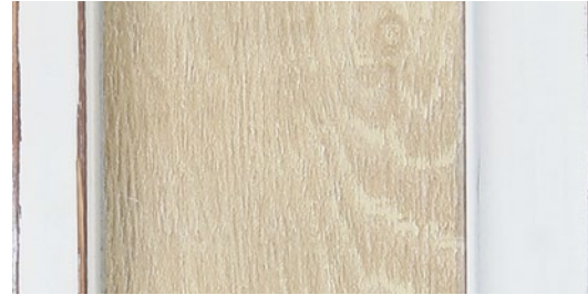
014-1323 | Natural