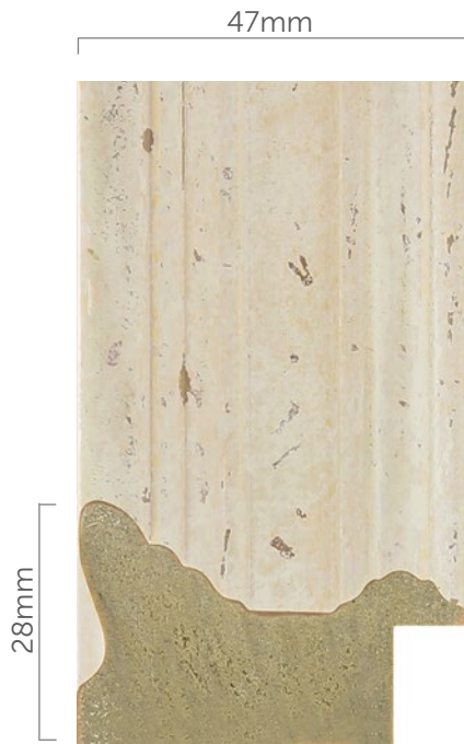
POL-7070 | Cream

Mainline Mouldings Ltd. 83 Langar Industrial Estate, Harby Road, Langar, Nottingham, NG13 9HY t: 01949 861000 w: mainlinemouldings.com e: sales@mainlinemouldings.com