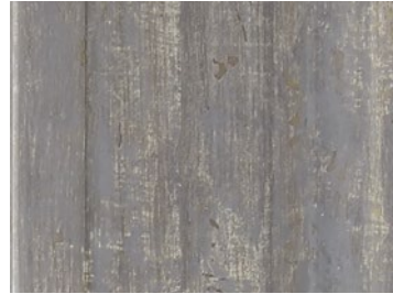
POL-7071 | Grey