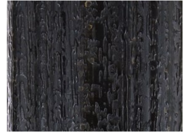
POL-7080 | Black